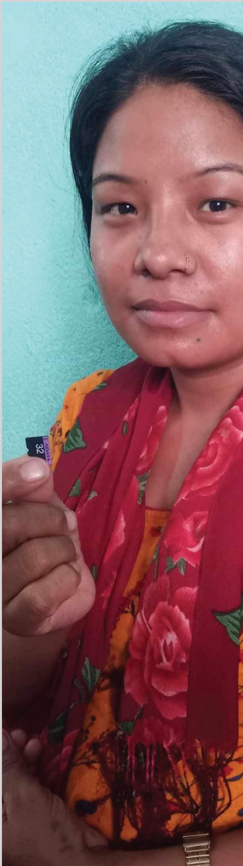
Pictured above: A Nepali woman receives a Micro SD Digital Bible